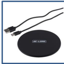
Image de l'article. Sample picture of the item.

L'objet décrit est conforme à la législation d'harmonisation de l'Union pertinente: The described object of the declaration is in conformity with the relevant Union harmonisation legislation: